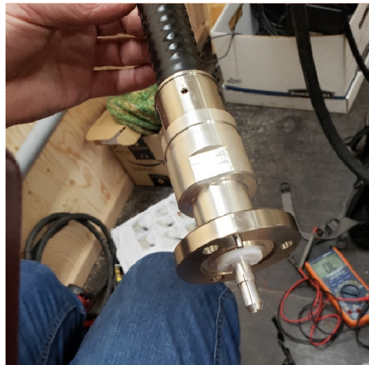
Coaxial feed line