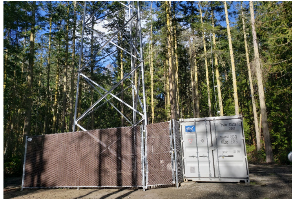
Completed Rainshadow Drive Transmitter Site

KPTZ is listener supported community Radio. Fueled largely by volunteers, KPTZ engages, informs and entertains listeners in the greater Port Townsend and Olympic Peninsula area. The past twelve months has seen the completion of an all-new digital broadcast studio at Fort Worden, and a newly commissioned broadcast transmitter site on Rainshadow Drive. Both the new studio and the new transmitter site were built largely by volunteers who spent many hundreds of hours on the projects.