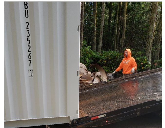
Transmitter building being delivered