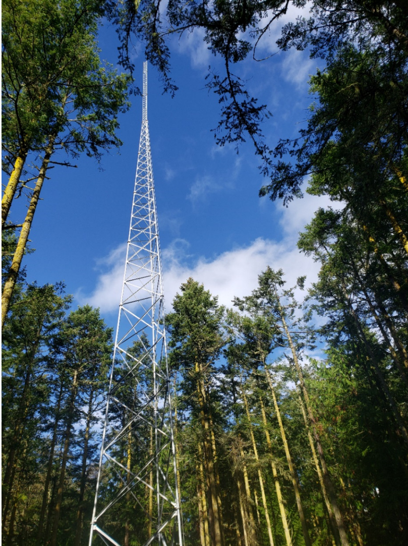
Newly constructed 200 ft. Self-Supporting tower.