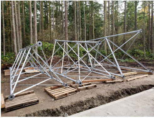
Tower Under Construction